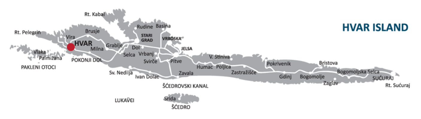
Fig 1. The town of Hvar on the island of Hvar.

Hvar (Figure 1) is a large mid-Dalmatian island covering an area of 110km<sup>2</sup>.<sup>2</sup> According to the 2011 census<sup>3</sup> there were 4,251 inhabitants in the town of Hvar compared to 4,143 in 1991 and 4,138 in 2001. There was a slight 2.6% rise in the number of people living in the town from 1991 to 2011 and 2.7% from 2001 to 2011.<sup>4</sup>