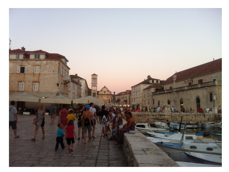
Fig 2. Saint Stephen's Square (called Pjaca), the largest square in Dalmatia.

The project Hvar – the Fortress of Culture (2016–2018) promoted another type of tourism on the island: cultural tourism for the new millenium. It emphasized the vast cultural heritage of the town and its long tradition in tourism and hospitality. "This project aims to present the town of Hvar as the cradle of Croatian culture and tourism for more than 150 years."<sup>13</sup>