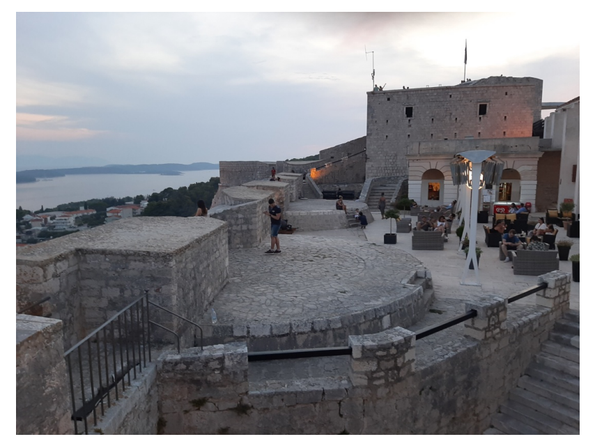
Fig 6. Hvar fortress called Španjola (2020).

The famous agave plant lace made by the Benedictin nuns is a tradition worth protecting. Though the nuns, because of their age, cannot work so much any more, we have to ensure their skills are passed on. Hvar Town has to be able to cater for different types of tourists because we have been doing it for the last 30 years. The tourism development strategy has never been clearly defined. (director of the Hvar Tourist Board)