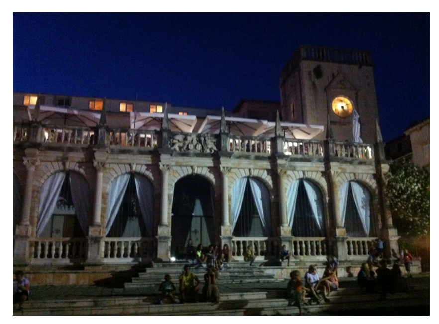
Fig 4. Hotel Palace Elisabeth (2019).