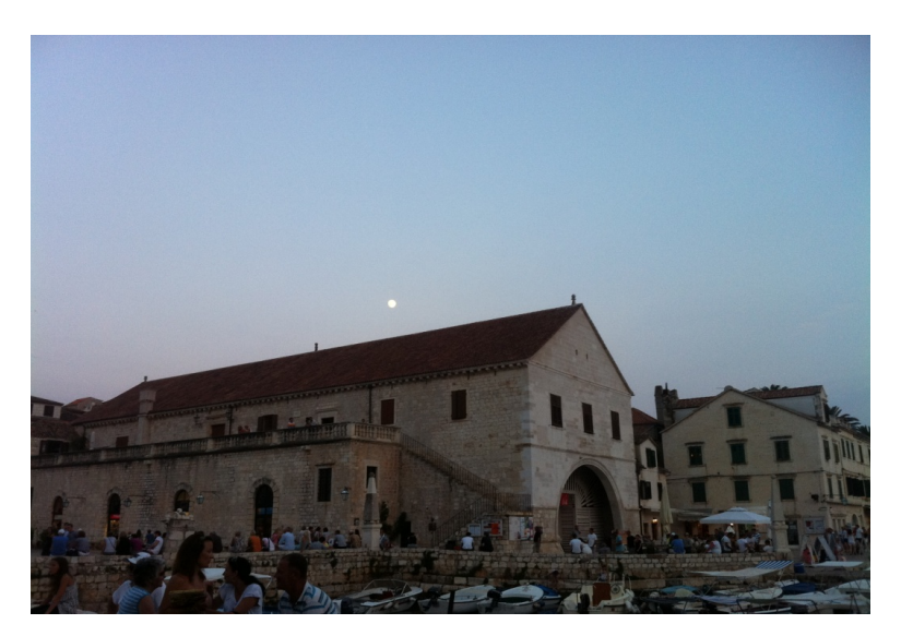
Fig 3. The oldest public theatre in Europe (Hvar 2019).

Ever since 2000 mass tourism has been growing steadily regardless of the ecological and socio-cultural capacity of the town. Between 2010 and 2017 the number of overnight stays increased by 62% in Hvar Town in comparison with 40% on Hvar Island and 53% in Croatia.<sup>14</sup> Such rapid growth of tourism is harmful to the existing ecological, social and economic resources of the town as well as damaging to the image of Hvar as a cultural and historical destination (for example, the oldest public theatre in Europe was opened in Hvar in 1612). (Figure 3) This type of tourism puts a lot of strain on the environment, identity and infrastructure management of the whole island.