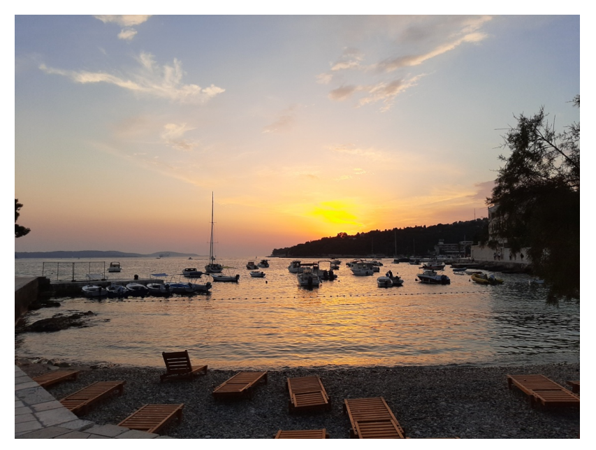
Fig 7. Empty beach in Hvar Town, beginning of August 2020.

There was some anxiety before the opening of the hotel but the very next day it was almost fully booked. The hotel opened on 14th July and in the first week we had 80% bookings. When guests arrive in Hvar they look for expensive hotels. (hotel worker)